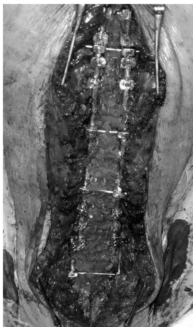
FIGURE 1. Intraoperative view of bioglass, associated to local autograft.

Postoperative follow-up for a minimum of 2 years was required for inclusion in the study. All patients had standing