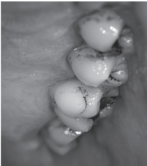
Fig. 1: Postoperative intraoral view on palatal aspects of upper posterior teeth. Note the very small gingival recession at the first upper molar done by a minimal postoperative shrinkage of the previously mobilized gingival flap to get access to the persistent infrabony defect

The two cases, in which we observed in the postoperative period premature loosening of the suture associated with exposure of the augmentation material into the oral cavity, resulted in reepithelisation of the dehiscence and successful healing of both surgical wounds. In conclusion, postoperative complications occurred in 50% of the treated individuals, however, they did not affect the success of the treatment. Higher price will be considered as a time- and